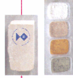
Strength mixing law Laboratoire Central des Ponts et Chaussées