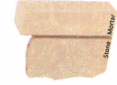
Color mixing law Université de Mons (HC Tech Lab)